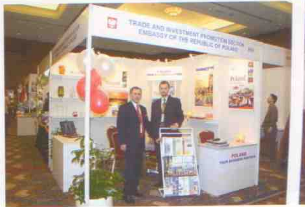
Stand of the Trade and Investment Promotion Section of the Embassy of Poland