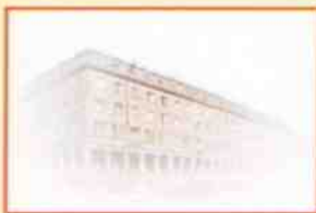
Ministry of Economy